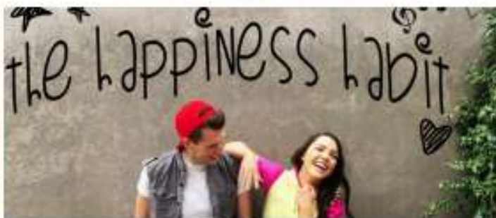
The Happiness Habit Prep - Year 4

These live performances engage students with important social-emotional skills, covering topics such as confidence, resilience, kindness, persistence, friendship and cooperation. The messages help students strengthen self-awareness and self-management of personal and social skills.