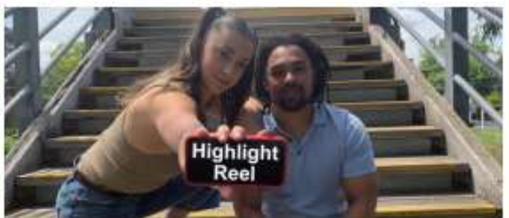
Highlight Reel Years 5 & 6