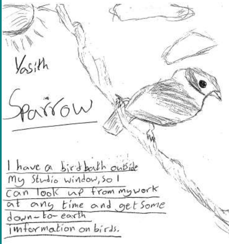
Great drawings from our budding artist Yasith